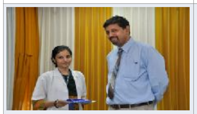
Guest speaker distributing the awards