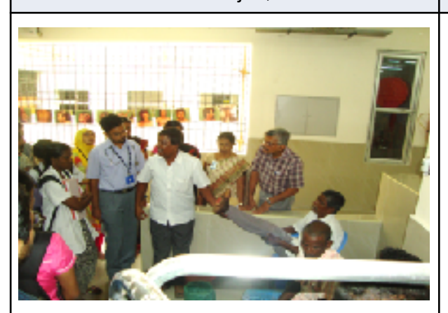
Demonstration of Cases of Leprosy by District level staff