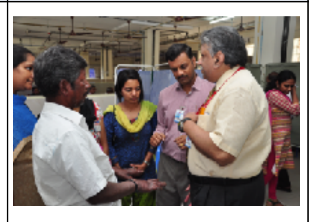
CME on Leprosy