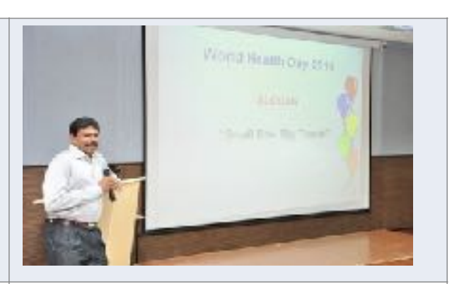
Faculty introducing the theme