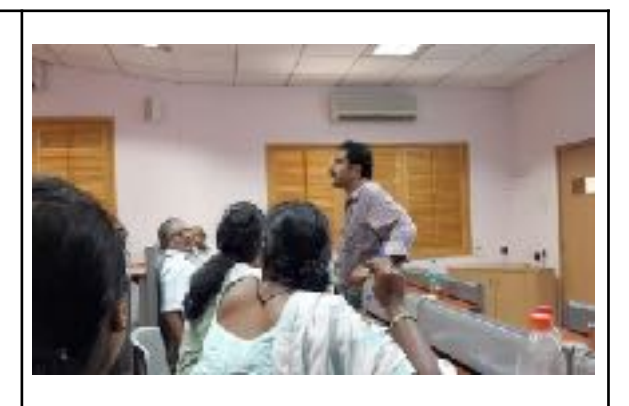
CME Adverse effects of immunization with pentavalent and OPV vaccine